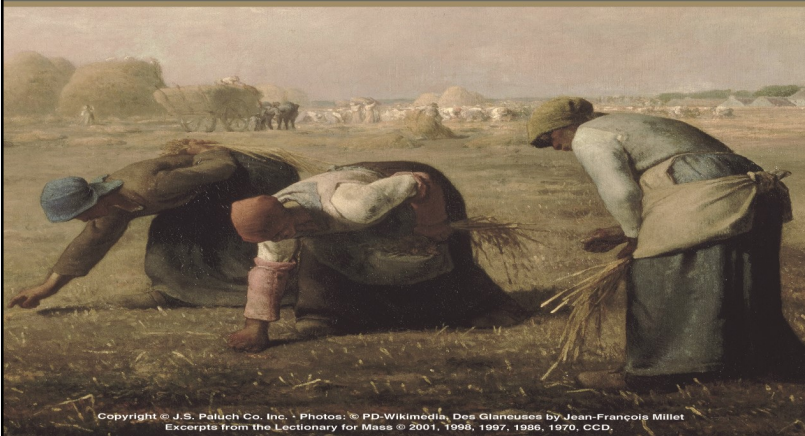
Copyright © J.S. Paluch Co. Inc. Photos: PD-Wikimedia, Des Glaneuses by Jean-François Millet Excerpts from the Lectionary for Mass © 2001, 1998, 1997, 1986, 1970, CCD.

Behold, the wages you withheld from the workers who harvested your fields are crying aloud; and the cries of the harvesters have reached the ears of the Lord of hosts.